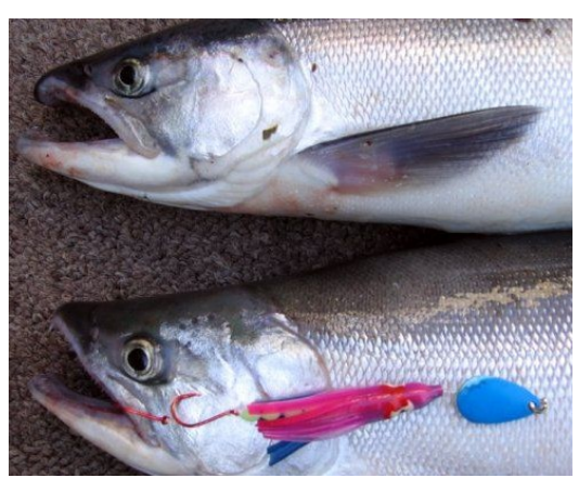
Quality Stampede Reservoir Kokanee

Kokanee routinely dine on their favorite species of fresh water forage called Daphnia which are small, planktonic crusta-