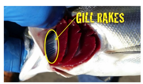
Kokanee gill rake