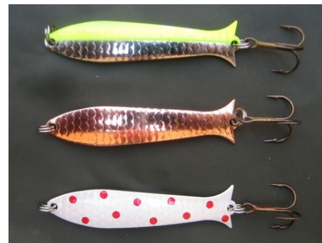
Thomas Lures Speedy Shiner