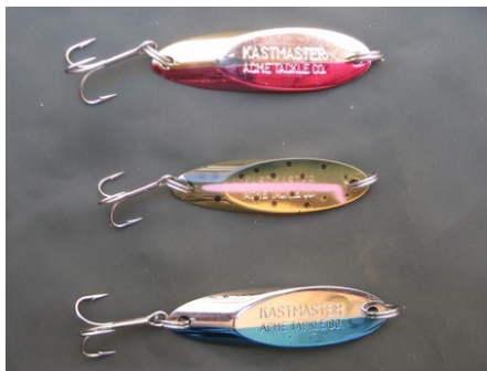
Acme Tackle Kastmaster

Kastmaster's balance produces wild action without line twist! The Kastmaster is machined from solid brass. It won't break, bend or corrode and it retains its luster. Kastmasters come in a range of different sizes and trout will hit several of them, but the 1/4 ounce version is my personal favorite. It's not too big for pan-size trout, but big enough to interest the big boys. In terms of color again my approach is systematic. I begin with natural colors that match the shad and smelt the trout feed on. If those colors fail to produce I start experimenting with bright offerings. Chrome, chrome and blue, gold, brass, brass and red, brass and orange and firetiger have been the most consistent Kastmaster colors for me over the years.