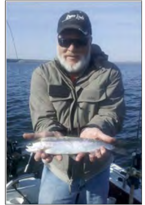
Folsom Bright Rainbow Trout