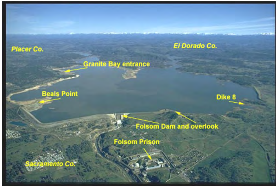
Folsom Lake. 7806 Auburn-Folsom Road, Folsom, CA 95630

Not far from the Folsom Prison made famous by Johnny Cash, is the great fishery Folsom Lake. The lake has a surface elevation of 466 feet with its 75 miles of shoreline intersecting El Dorado, Placer, and Sacramento County. It has nine boat launch locations make lake access easy for boat owners. Although the lake levels vary a lot, the lake recovers quickly and predictions are for high water levels extend into the future due to improvements to the dam.