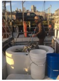
Picking up the Anchovies