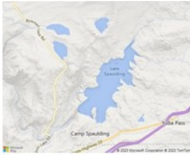
Lake Spaulding Map