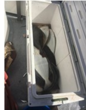
Box of Catch