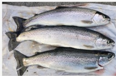
Trout caught by the author at Stumpy Meadows on April 24

MID ELEVATION SIERRA LAKES: This is the time to explore the mid elevation lakes on the Sierra west slope. Think lakes from 3500-5000' elevation like Sly Creek, Scotts Flat, Rollins, Sugar Pine, Stumpy Meadows, Union Valley, Sly Park ... Some of the smaller, lesser know reservoirs in the mid elevation range can be outstanding for trout and small mouth bass this time of year. This year should be exceptional for these lakes as they get plenty of cold water throughout the summer.