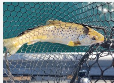
One of two Brown Trout caught also at Stumpy Meadows.