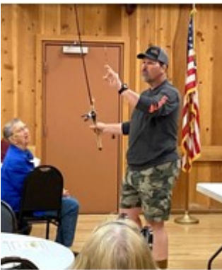
Cal Kellogg Hunt, Fish Productions